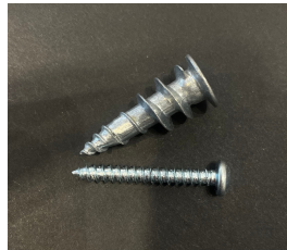
Drywall anchor + screw with flat inside edge

Here is an example of a drywall screw & brick screw that the Jeff Walker Gallery has previously used